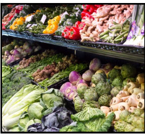
Members save five percent on the fifth of every month

Everybody is welcome; you don't have to be a member to shop at the Co-op!