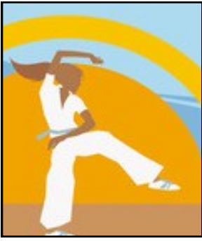
Attend the Co-op's health fair on August 27