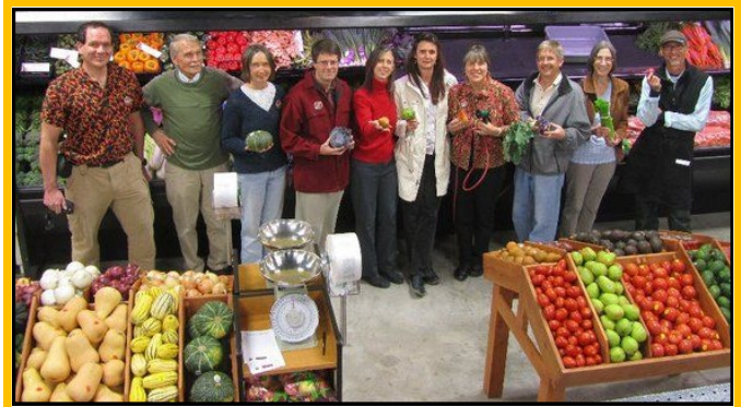
Board of Directors board@losalamos.coop