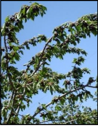
A cherry tree at the Cadwallader Orchard.