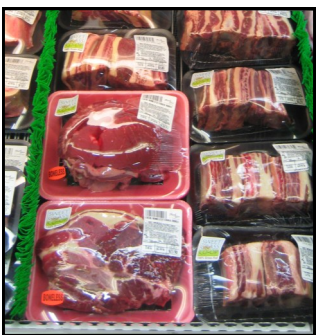
Dozens of different cuts of meat are available.