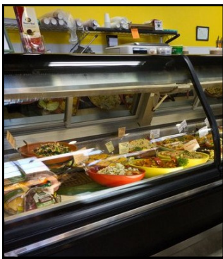
Choose from a selection of fresh deli items.