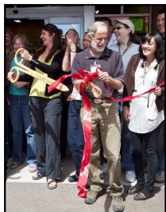
Ribbon cutting at the Co-op's Grand Opening on TK.