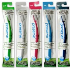
Preserve toothbrushes: good for your teeth and the environment