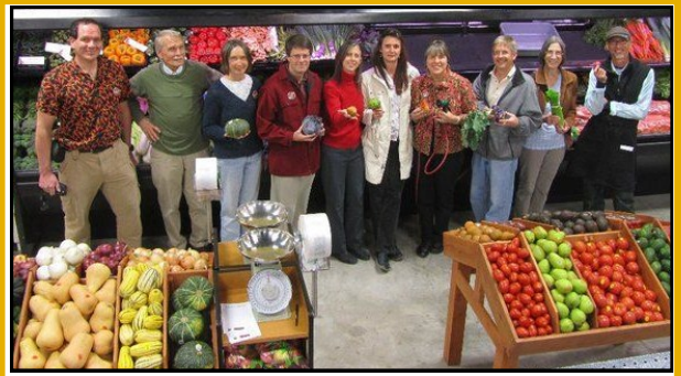
Board of Directors board@losalamos.coop