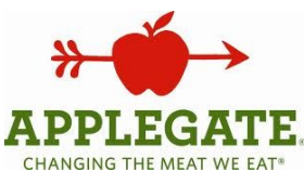
Sliced Applegate chicken breast now available at the deli counter

Everybody is welcome; you don't have to be a member to shop at the Co-op!