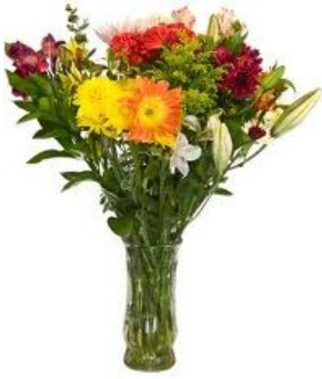
Co-op flowers are perfect for Valentine's Day!